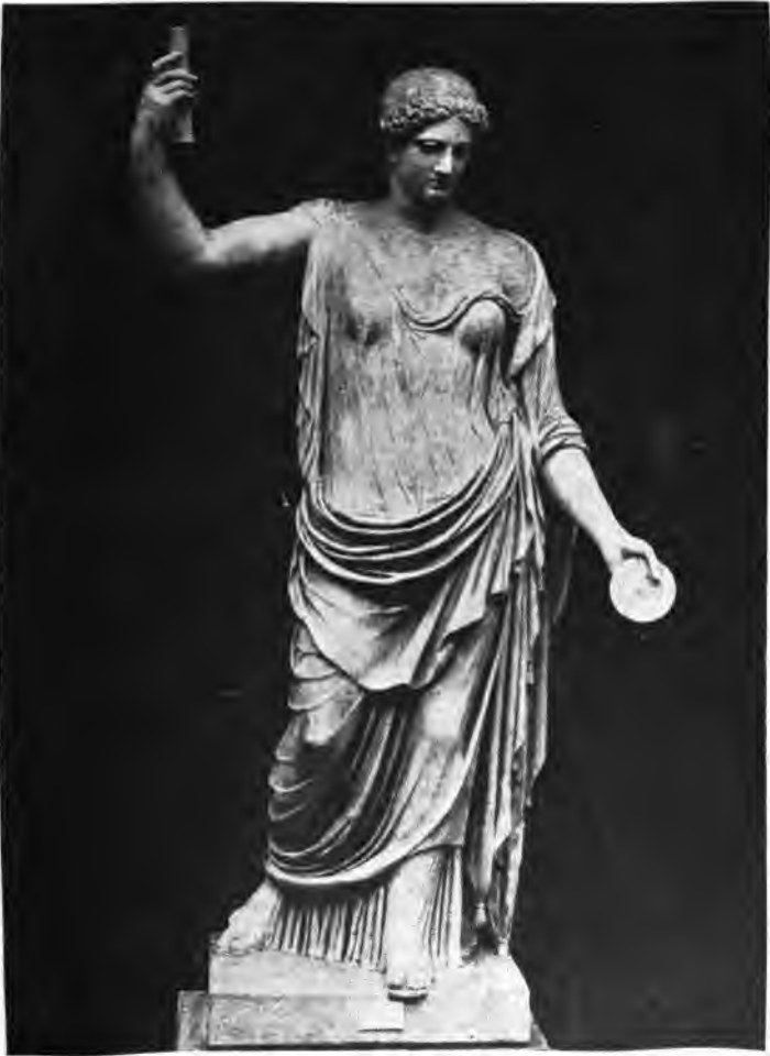
Fig. 7. Hera.